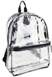
Example of a permitted clear backpack.

In an effort to improve the safety measures currently in place, CISD requires all students to use clear backpacks. Students participating in an extracurricular activity are permitted to carry non-transparent bags to store items pertaining to their particular activity (i.e. band, athletics, etc.). Upon entry into the school, all extracurricular activity bags must be stored in designated areas. All bags are subject to search. Additionally, the maximum size for non-transparent bags that students will be permitted to carry during the school day, such as lunch kits, pencil bags, and purses, will be 6" x 9".