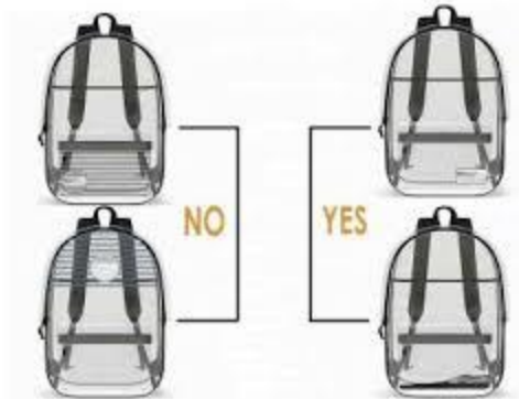
Backpacks with stripes on the left are not permitted.

No. Stripes in any location are not allowed on the backpack (see example)